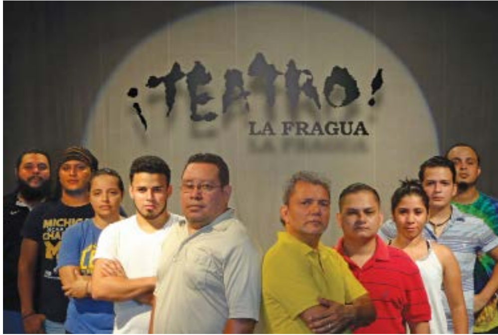
Teatro La Fragua in Progreso, Honduras, uses the theater as a creative commons, a civic space for dialogue, action and evangelizing – while providing the cast, crew and staff with steady jobs.