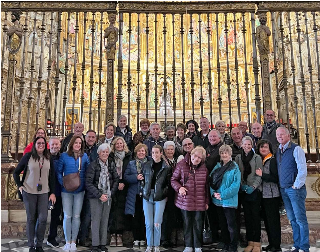
Pilgrims on the very first Advancement pilgrimage gathered in front of the gold-encrusted choir loft in the Cathedral of Toledo, Spain, tracing the footsteps of St. Ignatius. Many have already signed up for the second Advancement pilgrimage to Italy in March, 2024. They were and remain a close-knit group.