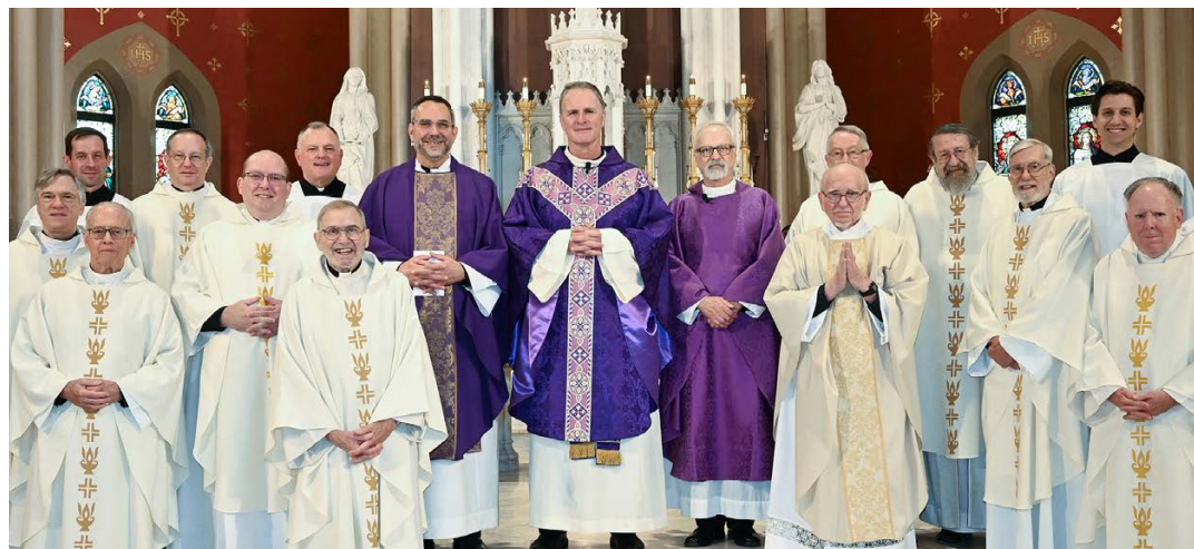
The province celebrated New Orleans-based Jubilarians at Holy Name of Jesus Parish.