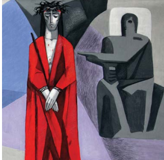
Stations of the Cross from the Church of the Holy Trinity in Gemunden am Main, Bavaria, Germany.