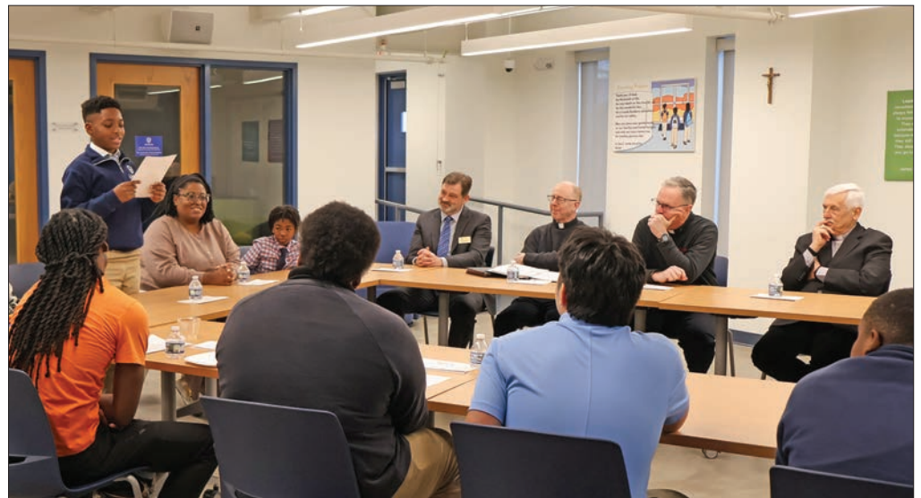
Loyola Academy students demonstrate tremendous poise and sincerity while sharing with the Superior General why their school means so much to them.