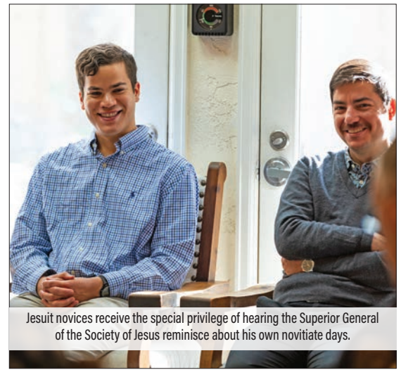
Jesuit novices receive the special privilege of hearing the Superior General of the Society of Jesus reminisce about his own novitiate days.