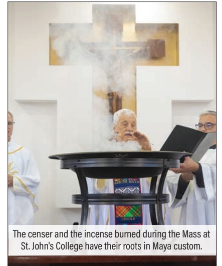
The censer and the incense burned during the Mass at St. John's College have their roots in Maya custom.