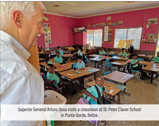
Superior General Arturo Sosa visits a classroom at St. Peter Claver School in Punta Gorda, Belize.